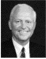
Benjamin R. Civiletti

Mr. Civiletti has been Chairman of the law firm Venable, Baetjer and Howard since 1993 and was the Managing Partner of the firm from 1987 to 1993. From 1979 to 1980, Mr. Civiletti served as the Attorney General of the United States. He is a former Chairman of the Board of the Greater Baltimore Medical Center; the Founding Chairman of the Maryland Legal Services Corporation; a Director of Bethlehem Steel Corporation; a Director of MBNA Corporation and MBNA International; and a former Director of The Wackenhut Corporation. Mr. Civiletti is a Fellow of the American Bar Foundation, the American Law Institute and the American College of Trial Lawyers. He was Chairman of the Maryland Governor's Commission on Welfare Policy in 1993, and a member of the Maryland Governor's Task Force on Alternatives to Incarceration in 1991. (b)(c)(e)(f)